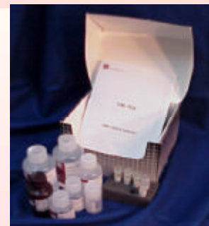
DNA Isolation Kit

The OXI-TEK DNA Isolation Kit is designed for isolating high molecular weight genomic DNA from whole blood, cultured cells and tissues.